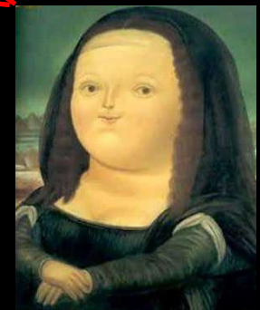
Fernando Botero Mona Lisa, Age Twelve (1959) Museum of Modern Art New York http://www.moma.org Inv. 279.1961